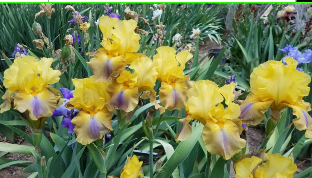
1st place - Garden - Kevin - 'Can Can Dancer'