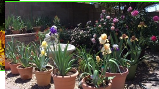
2nd place tie - Garden - Melania - various