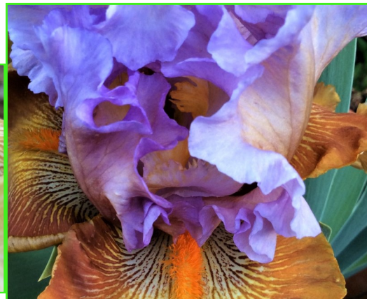
2nd place Macro - Sue - 'Valley of Dreams'