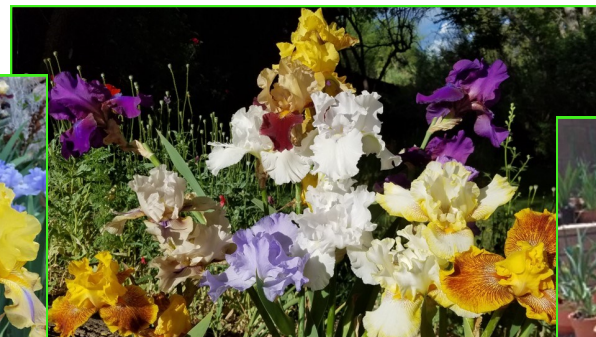
2nd place tie - Garden - Kevin - bouquet in the garden