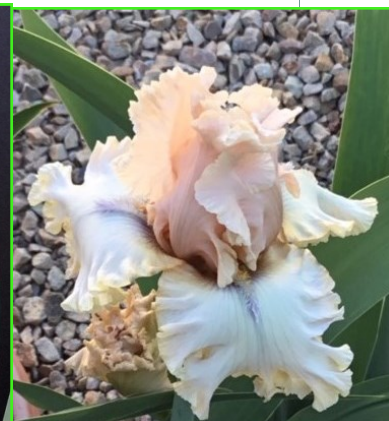
2nd place 3-way tie - Single blossom or stem - Sue - 'Queen's Circle' and 'Opposites' and Melania - 'Ice Cream Sundae'