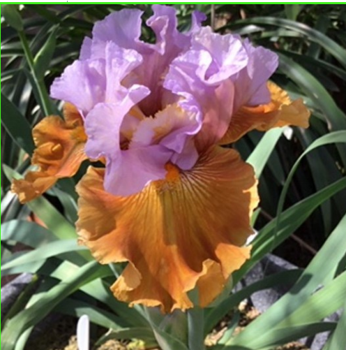
1st place - Single blossom or stem - Melania & Tony - 'Valley of Dreams'